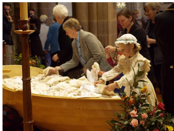
"Blessing of the Bonnets" in Hobart