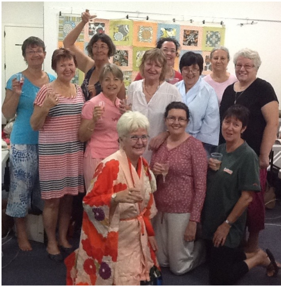
Some photos from previous years of our Ladies of the Night—whoops—members, getting into the spirit of the evening !