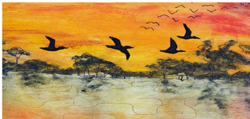
"Longreach Lagoon" (detail) Heather Bingham