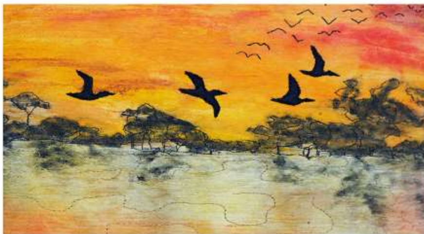
"Longreach Lagoon" (detail) Heather Bingham