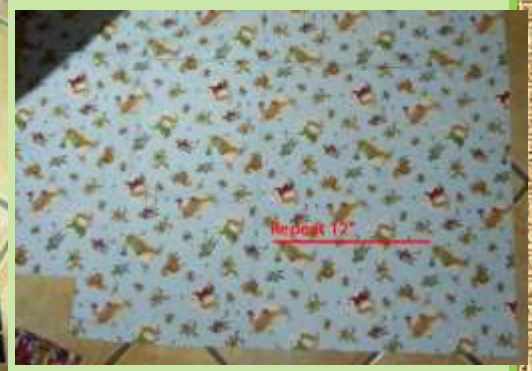
Whilst I think this would work I also think it would be pretty boring!!