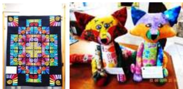
Two of the 29 foxes and Inca Sunrise, a foundation-piece design published in Down Under Quilts

I am going through a cupboard full of unfinished/unstarted projects and trying to whittle them down because as the years go by I think "How long have I got to clear up this mess?" So that pile is reducing slowly. Whenever I hear of a new baby due in my family I make them a family tree quilt to keep them mindful of their heritage. (Genealogy is almost as addictive as quiltmaking.) I take photos of scenery for landscape quilt inspiration – mainly used for wedding or anniversary gifts. And I am currently exploring ways to combine quilts and maps. Then there are the foxes – 29 at the last count. So "last/current/next" changes weekly.