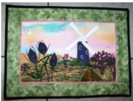
Wall Quilt made for my cousin's wedding in Sussex in 2012

I do like to see something which, however outlandish, is well made rather than just thrown together. The quality of finish is very important to me and I think it says something about the maker not valuing their own work if they are sloppy. I have learned not to mind raw edges, but they must be carefully attached.