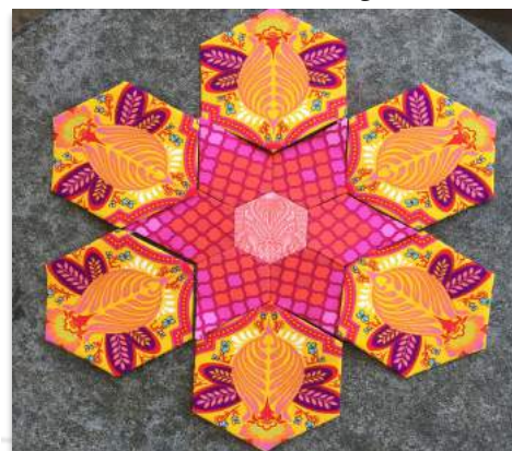
Random Paper Piecing

One last thing... I have an Instagram account that I occasionally post to, check out stacey_hendo