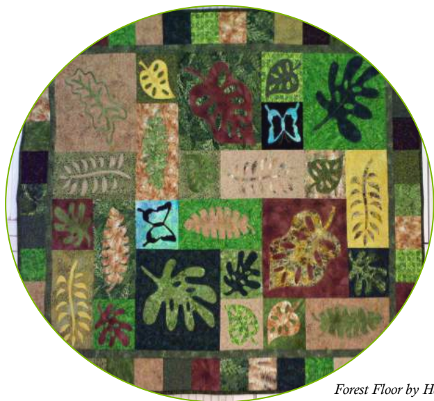
Forest Floor by Helen Tate