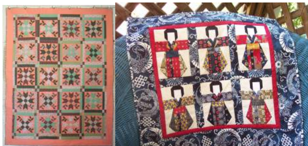
30 Years in the making