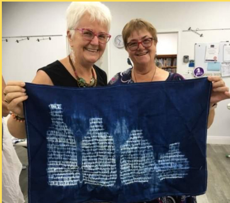
Shibori bottles- thanks Robyn for squashing bottles

Please email darwinpatchworker@gmail.com for more details.