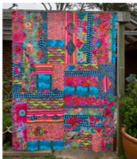
It's a Breeze