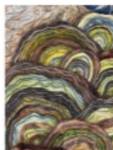
Runner Up 2024 - Zara Zannettino

Old Auction House Gallery 52 – 56 Mollison Street KYNETON, VIC 3444